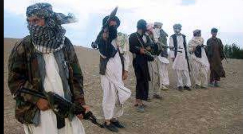
Taliban and ISIS using religion to assert political power in the Middle East

Religion, Race and Politics continue to fuel conflict across the globe.