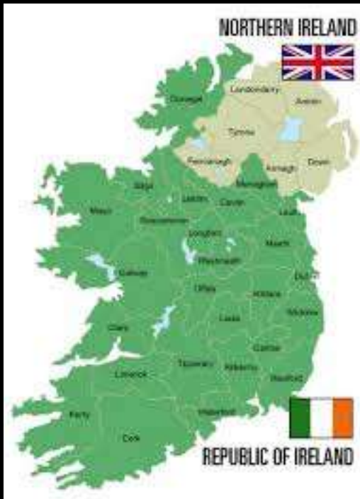
Catholics and Protestants in Northern Ireland