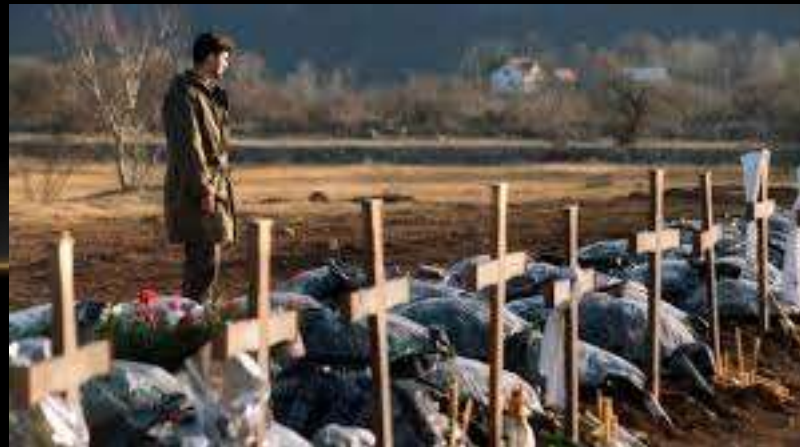
Ethnic cleansing in the Balkans