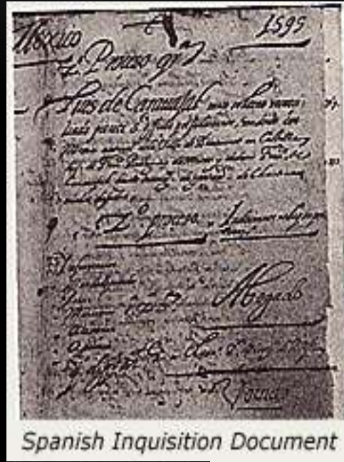
Spanish Inquisition Document

Came up with the rules and laws of the Inquisition